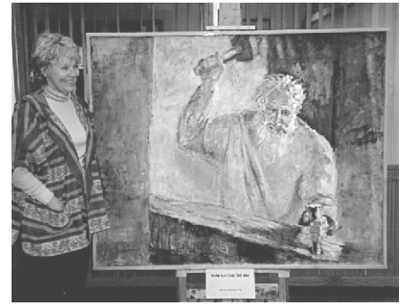
The book contains about 250 paintings and sketches in 17 chapters, and includes horses, flowers, children, beaches, lakes and urban scenes.